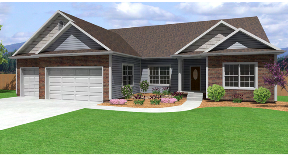
Renderings depict optional features.