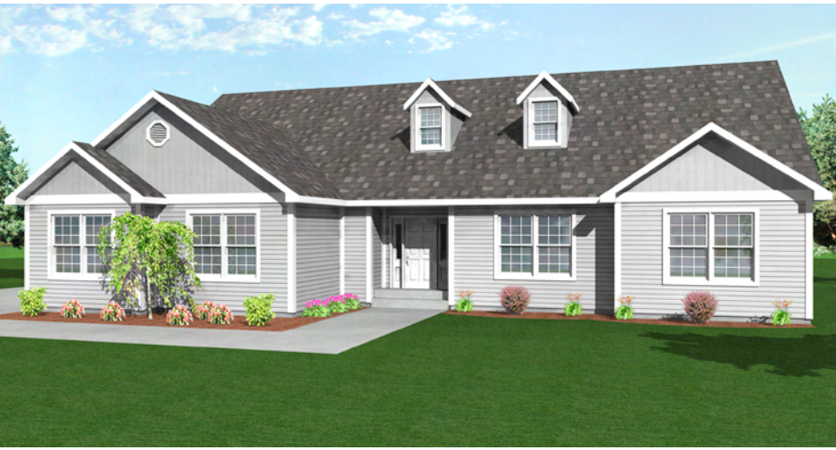
Renderings depict optional features.